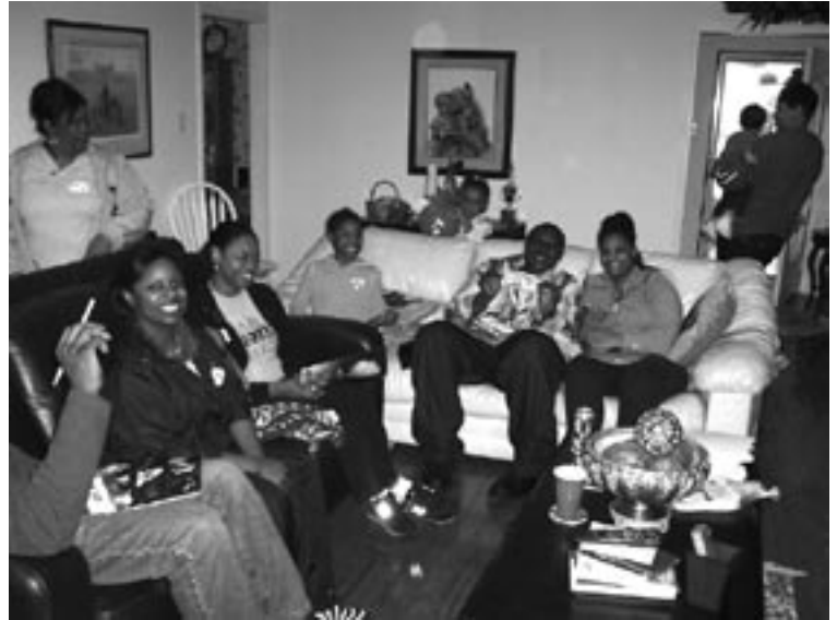
WCAAA Youth Advocacy Board meets to make plans for creating smoke-free homes.