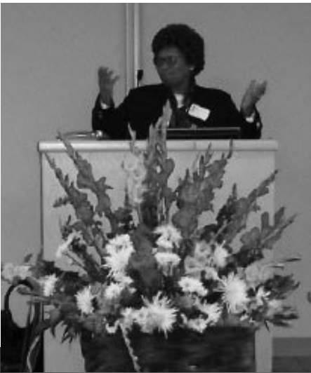
Dr. Joycelyn Elders educates 135 women on ills of tobacco products and other health related issues at the January "Woman, Thou Art Worthy" Conference held at Philander Smith College.